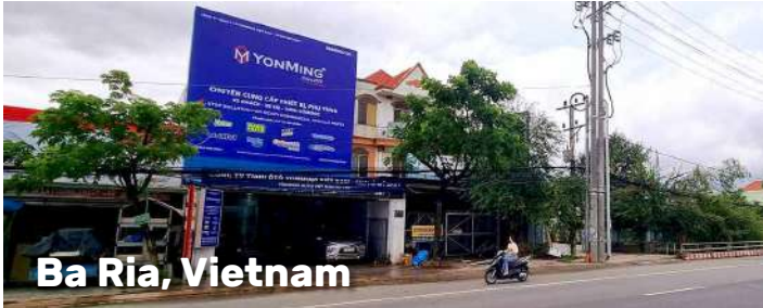
Ba Ria, Vietnam

Within the same year, we increased our global footprint by opening three additional international locations to serve a wider variety of customers.