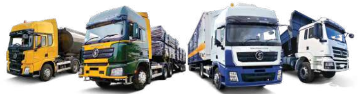
Prime Mover & Rigid Trucks SHAANXI TRUCK SDN BHD

As an authorised distributor of Shacman trucks in Malaysia, we promote and sell the Prime Mover and Optimized X Series, which are the top of the line in their class, with better fuel efficiency, higher horsepower, and a safer cabin. With a total of 22 service centres and over 20 breakdown assistance branches across Malaysia, we offer excellent after-sales service for repair and maintenance. In addition, our 24-hour Breakdown Res-Q Team and hotline phone call covering all of Malaysia will offer peace of mind to every Shacman owner.