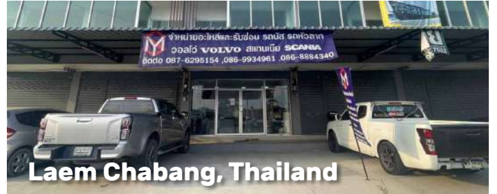
Laem Chabang, Thailand