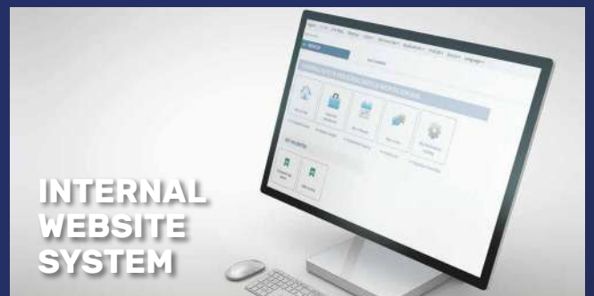
INTERNAL WEBSITE SYSTEM

We operate efficiently with our fleet of over 60 delivery vehicles. Local deliveries can be completed within the same working day of the order's placement.