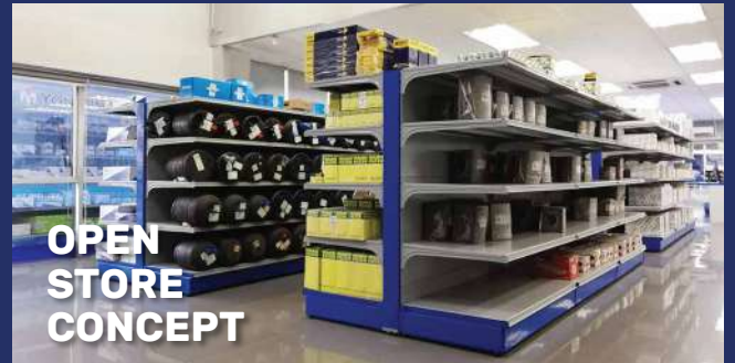
OPEN STORE CONCEPT

Over 20 Res-Q Team vehicles are in operation to expand the boundaries of services. Offering full equipment repair with just a phone call.