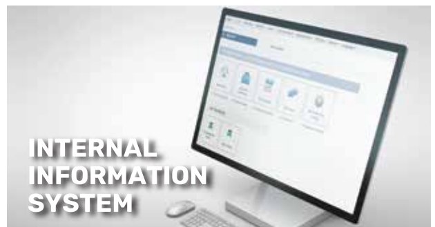
INTERNAL INFORMATION SYSTEM

We can operate efficiently with the fleet of over 60 delivery vehicles. Local deliveries can be completed within the same working day of placement of order.