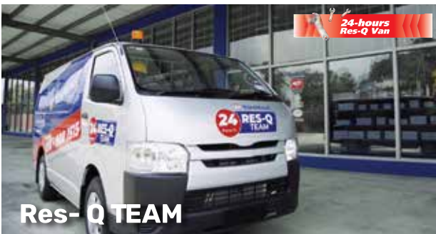
Res- Q TEAM

Huge workshop area with experienced mechanical crew ready to assist for maintenance service. Heavily equipped with sophisticated tools for testing and diagnostic to better care business partner's commercial vehicles.