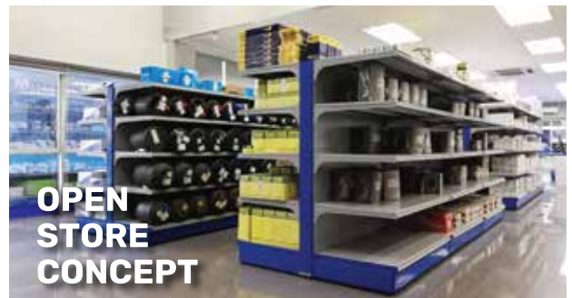
OPEN STORE CONCEPT

Over 20 Res-Q Team Vehicles are in operation to expand the boundaries of services. Offering full equipment repairing with just a phone call.